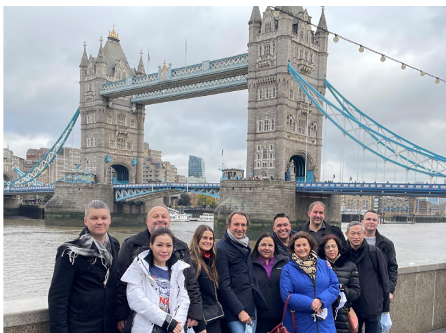
Touax Team at Tower Bridge

It was also the opportunity to share a visit of this beautiful city!