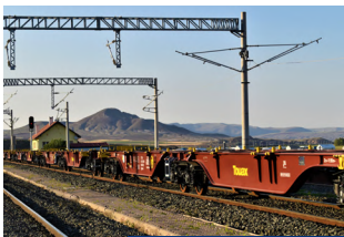
6 axle wagons Sggrss 80' and 90'

As a certified Entity in Charge of Maintenance, every year Touax Rail ensures the maintenance of more than 10 642 plateformes in Europe and UK, to make sure they always run safely along their in-service life-cycle.