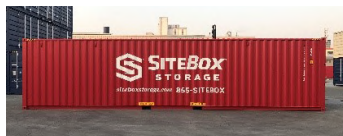
Customised storage unit

2021 saw increasing lease durations for new containers, in average at 12-13 years, and contractual extension of the existing fleet on life-cycle leases. Touax Container's average utilization rate over the period was at 99.6% thanks to these favorable market conditions and the valuable support from its customers.