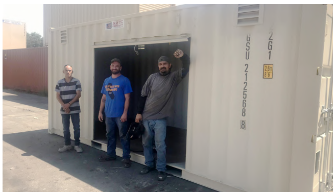
The winners of the contest

Touax Container is working on new ideas to please its buyers in 2022!