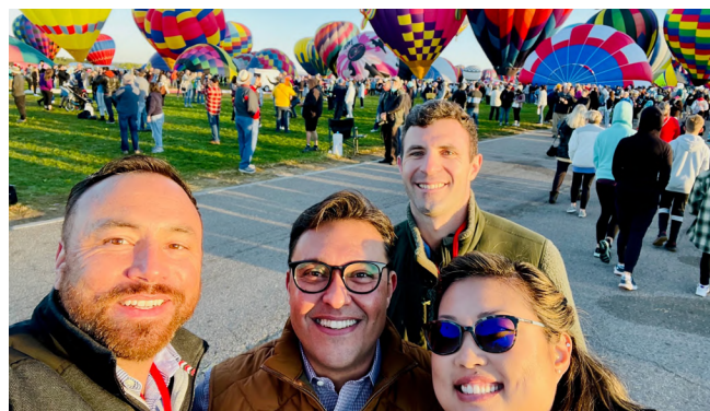
Touax Team at NPSA

It was a great occasion to thank all our partners that contributed to one of the record year of Touax Container in the resale and trading activity in North America.