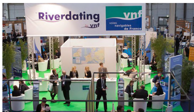
River Dating Exhibition

For more details, please visit the website: https://riverdating.vnf.fr